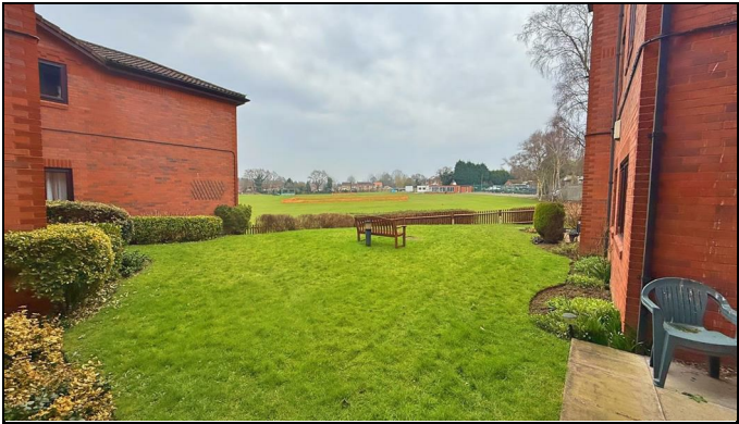
St. Georges Court, Clarence Road Four Oaks,